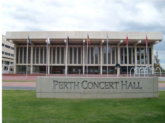
1973 Perth Concert Hall