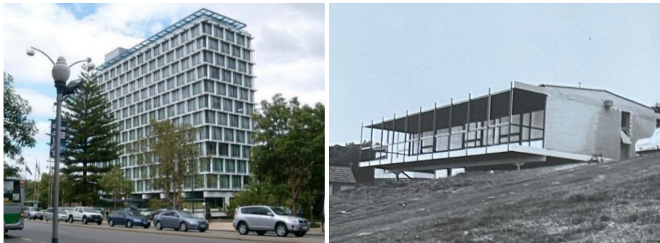
1963 Council House Perth (Wikipedia); 1964 Waller Residence at 282 West Coast Highway Scarborough (Julie & Sam Ruiz)

One of the most distinctive elements of the building is the pattern of T-shaped sunshades placed uniformly against the four glazed walls of the building. According to Lindsay Waller there was only one possible dimension that would allow the Ts to go around the corner and repeat themselves. This dimension was arrived at empirically and was set out by Waller after numerous geometric experiments. The result is an apparently floating cage of Ts creating a continuous mat of a sunscreen which folds seamlessly around the corners of the building.