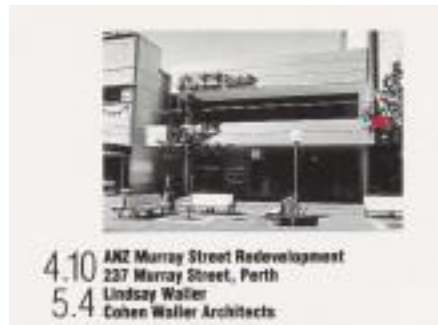
Cohen Waller Architects' RAIA (WA) Commercial Awards entry 4.10 for the ANZ Bank's 237 Murray Street Perth redevelopment ( The Architect , 1990 Winter edition, p.29).