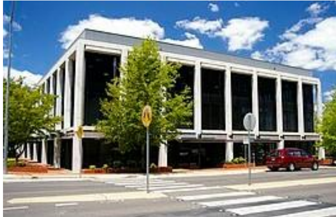
1965 Reserve Bank of Australia Building, Canberra in 2009 (Wikipedia 2025)

H&B won another competition in mid-1962, for the Reserve Bank in Canberra, judged the best of 131 submissions. The Reserve Bank of Australia Building at 20-22 London Circuit Canberra ACT is now heritage-listed. It was built from 1963 to 1965 by Civil & Civic, and added to the Australian Commonwealth Heritage List in 2004. Don Bailey recalls that Waller was instrumental in H&B 's work at the Harold E. Holt naval communication station, a joint Australian and United States base at Exmouth, first commissioned in 1967.