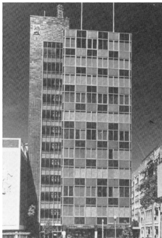
MLC Building at St George's Terrace Perth.