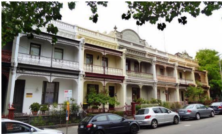
Melbournia Terrace 1-13 Drummond Street, Carlton of 1877