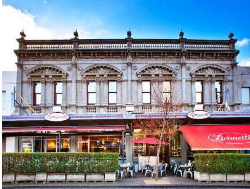
Shops and residences at 198-204 Faraday Street, Carlton of 1886 ( http://www.commercialrealestate.com.au/property/7754871/for-lease/vic/carlton/retail )