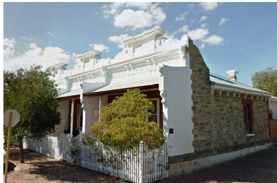
Attached housing at 46-52 King Street, East Fremantle of 1910

is distinctive. The HCWA record for the place notes that other Hitchcock-designed buildings in the East Fremantle area include: the 'George Street Mews', 107-121 George Street; terrace houses at 46-52 King Street; two semi-detached houses at 25-27 Sewell Street and a gable fronted detached house in Hubble Street. Many other buildings in the Fremantle area (but also in Subiaco and Nedlands) have been identified as likely Hitchcock buildings due to their distinctive decorative treatments, but these attributions have yet to be verified.