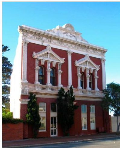
Glanville's Buildings on Canning Highway, East Fremantle of 1902

In WA Hitchcock again specialised in the design of housing, particularly in Fremantle and surrounding areas. Heritage Council of Western Australia (HCWA) documentation records that his work is notable for his repeated use of distinctive design and decorative details that assist to identify his architecture. These include pressed cement female faces to terminate corbelled party walls, cement putti set in a gable niche, scalloped barge boards with 'tear drop' turned timber knobs, roman chariot wheels used as pediment brackets, semi-circular pressed cement chimney baffles, stucco swags and rusticated panels. Hitchcock's combinations of these decorative elements provide a theatrical effect to what are otherwise relatively modest buildings.