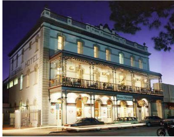
Federal Hotel, now Rosie O'Grady's, William Street, Fremantle