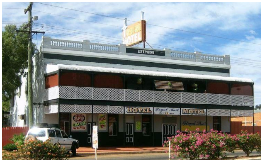
Royal Motel Hotel, Meekatharra in 2008.