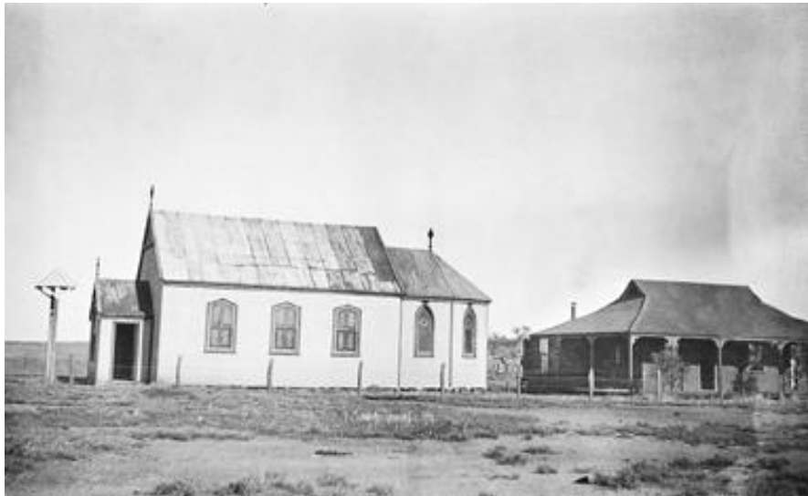
St Saviour Church Yalgoo, at left of photo, opened on 1 September 1907, but has been demolished (courtesy of Dominican Sisters, Doubleview).