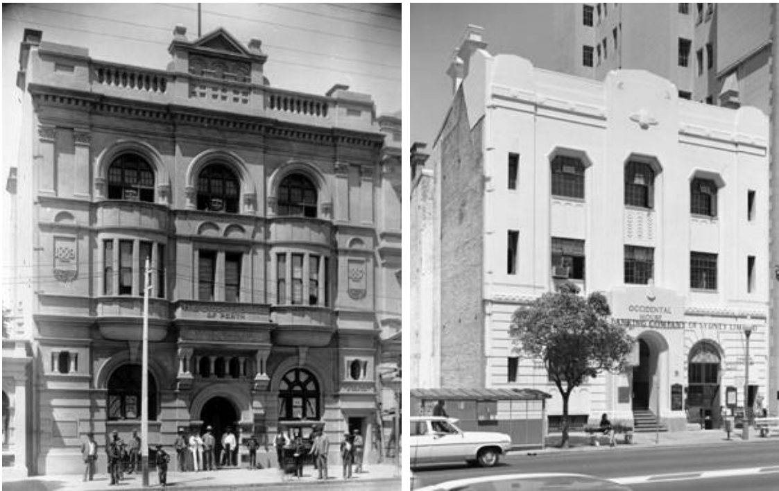
Stock Exchange, St George's Terrace Perth, at left as completed in 1897 and at right, severely 'modernised' in the 1930s